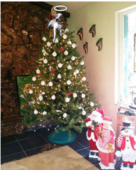
I'm atop the tree 'cause I'm an angel