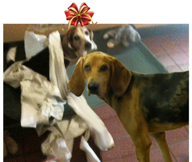
I wrapped Rascal for Christmas