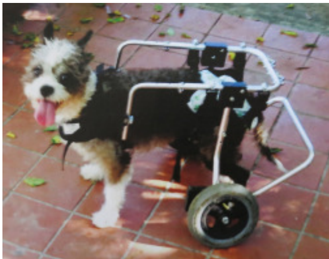
All I want for Christmas is my Doggon' Wheels! Thank you, Santa!