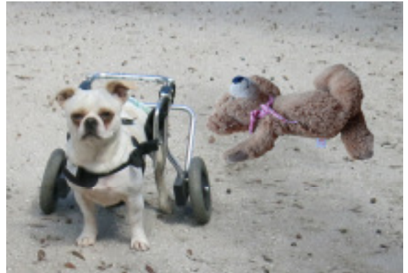
Grandma got run over by a reindeer.