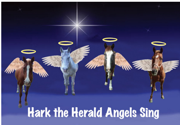
Hark the Herald Angels Sing