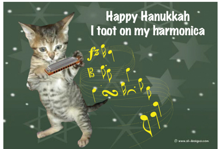
Happy Hanukkah I toot on my harmonica