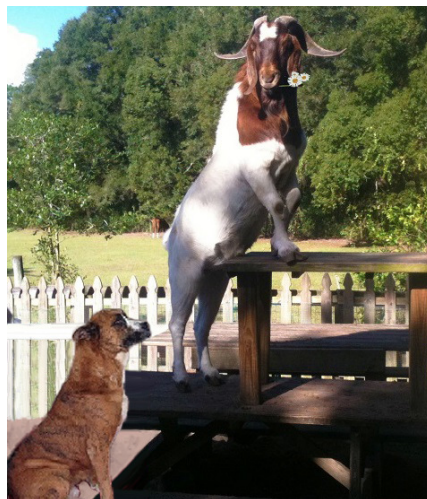
That's not mistletoe, so don't kiss me!