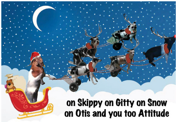
on Skippy on Gitty on Snow on Otis and you too Attitude