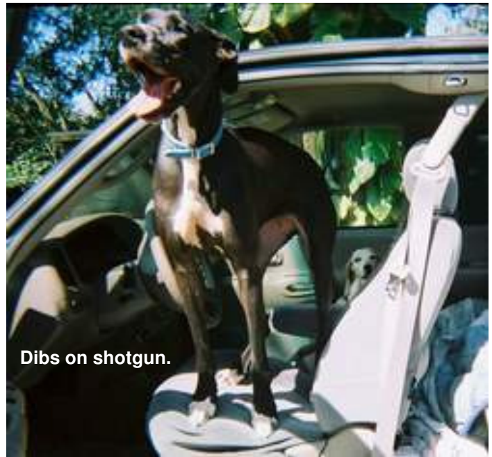
Dibs on shotgun.