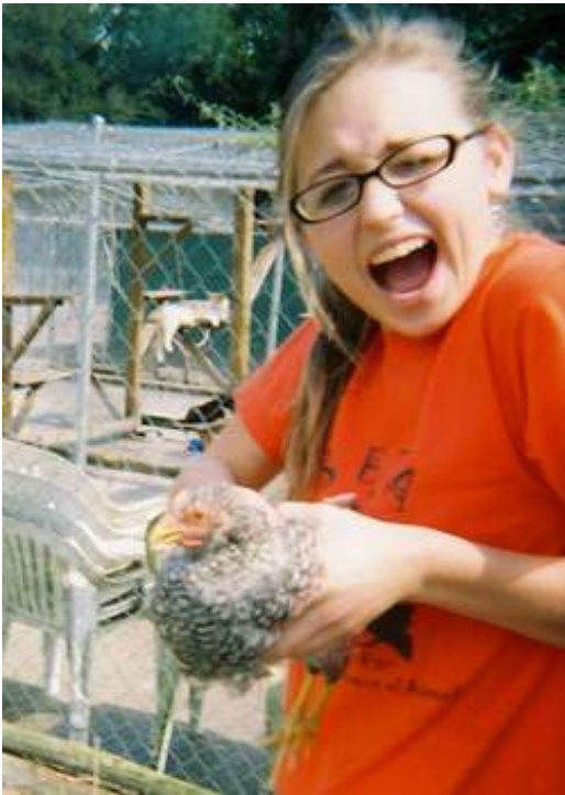
Hot Potato, Hot Potato!