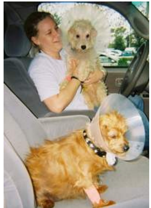
We're going HOME!!