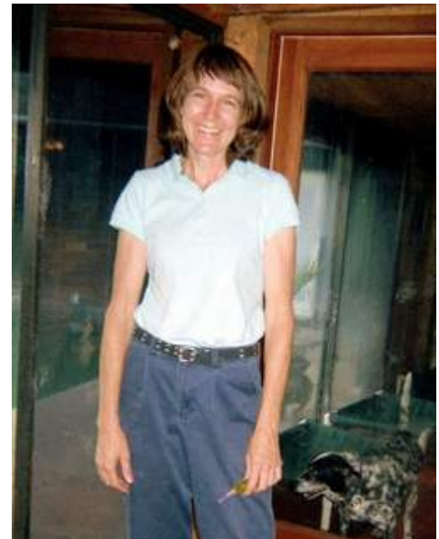
Pedicure's finished. Who's next?