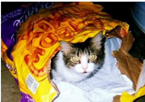
Ready for seconds.