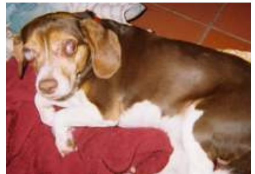
I'm not Eddie Cantor. I'm Bailey.