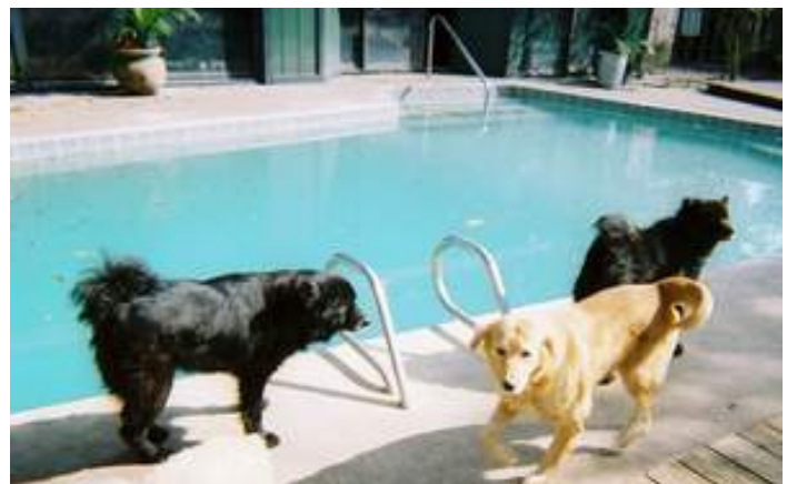
Hey Look! This motel has a pool!