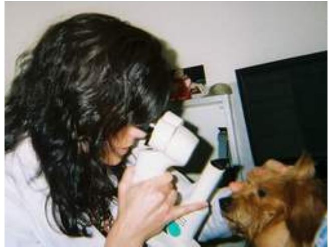
Looking for Troubles.