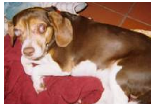
I'm not Eddie Cantor. I'm Bailey.