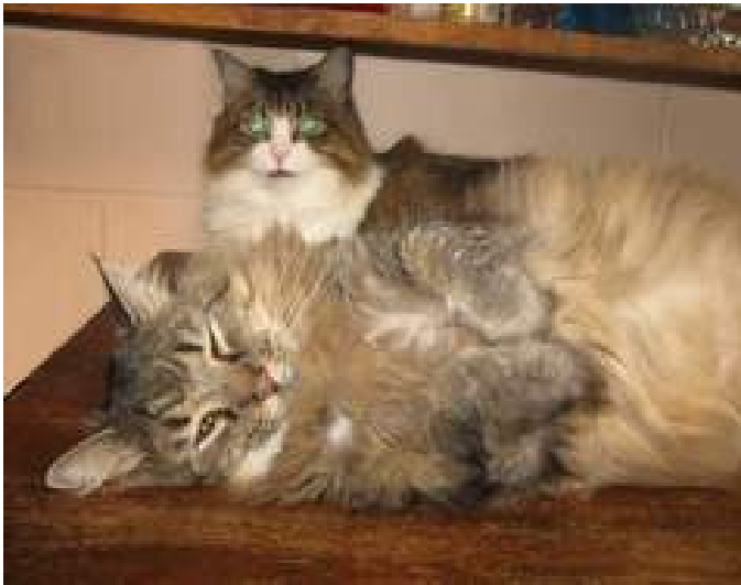
Give me another 5 minutes, will ya?