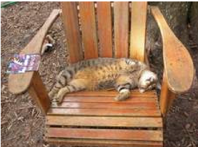
A little light reading, then a nap