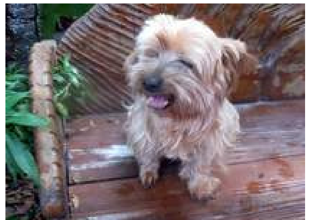
The whole world smiles with you