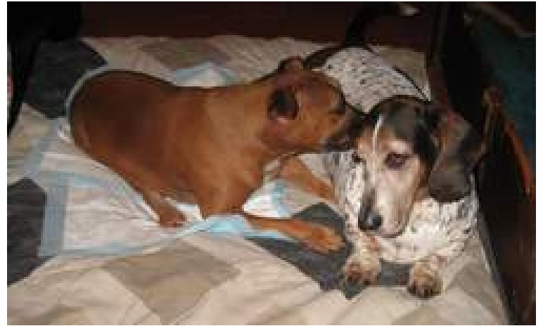
Don't tell a soul