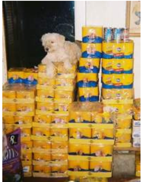
I'm the King of the food. No, really I am.