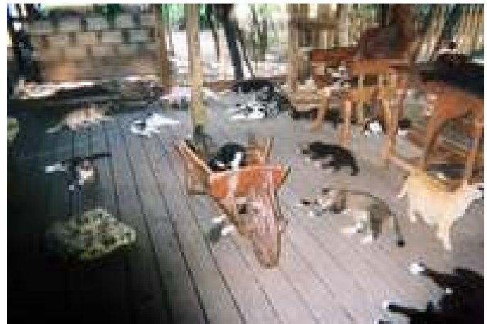
Alfred Hitchcock's, "The Cats"