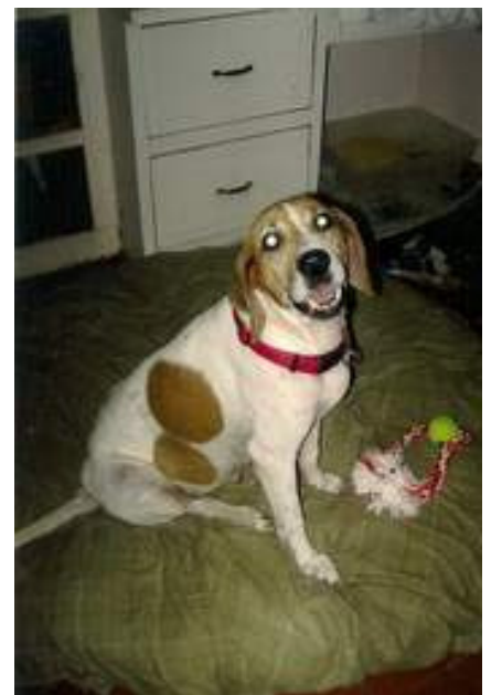
TODAY - Lola at 65 lbs.