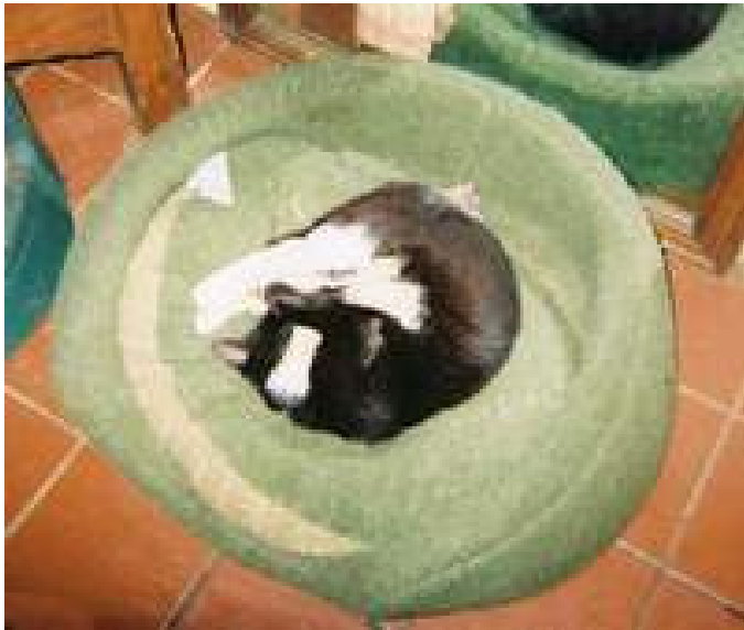
Does my butt look big?