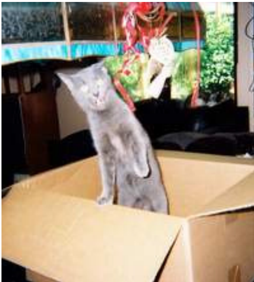
Bring on Mike Tyson!